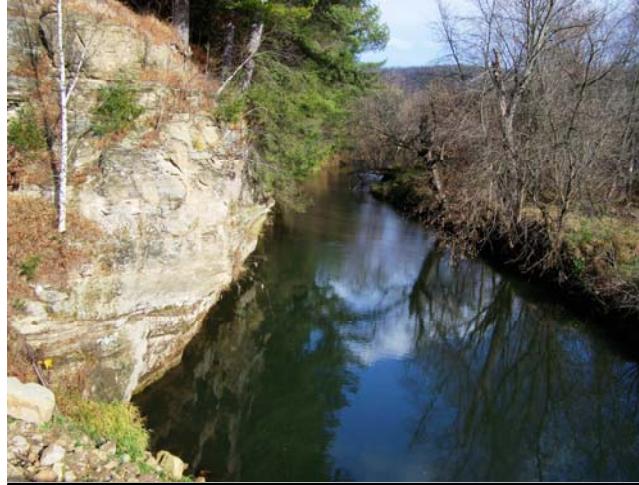
ACT LOCALLY! Community Conservation launches the new Kickapoo Community Sanctuary with its first model project, the Lower Kickapoo River Initiative, in 2007-8.