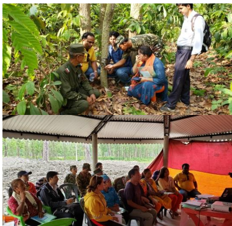
Attendees at the first two trainings learned to identify signs of wildlife, use GPS, and set up wildlife cameras.

Progress towards our goal: a community-managed wildlife corridor in southern Nepal